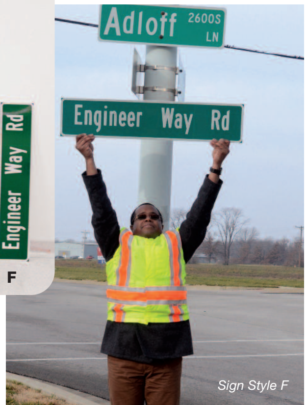
Sign Style F

F - 8" High Sign Blank; 4" UC / 3" LC; with Border; B-Series Font