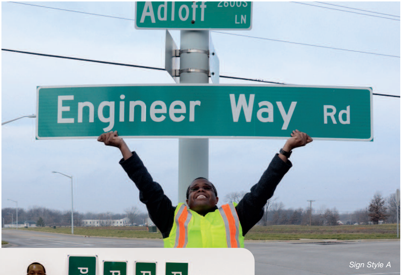
Sign Style A