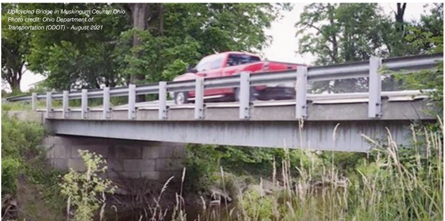
Up-cycled Bridge in Muskingum County, Ohio Photo credit: Ohio Department of Transportation (ODOT) - August 2021

Contact the Ohio LTAP Center for information.